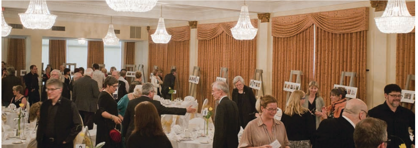
Presidents' Dinner, Walper Terrace Hotel's Crystal Ballroom, Kitchener