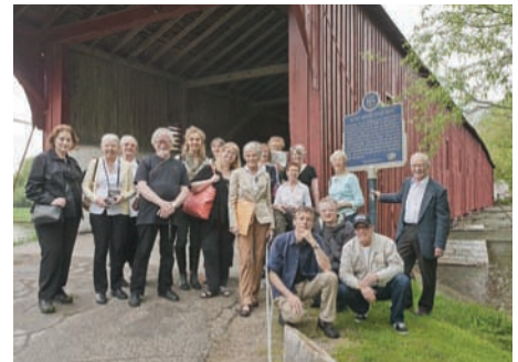
RCA Members near Elora, Ontario standing at the foot of the last remaining covered bridge in Ontario