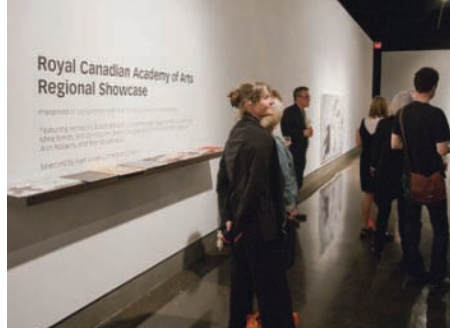
RCA Regional Members' Exhibit reception held at University of Waterloo Art Gallery