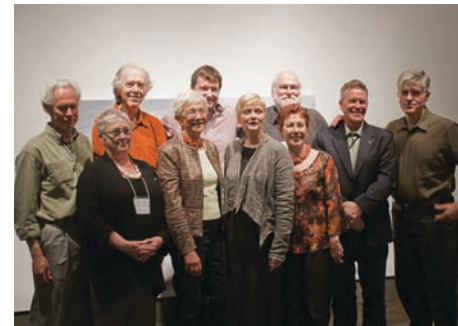
Kitchener/Waterloo Regional Members at the University of Waterloo Art Gallery

Finally, our sincere thanks go to the following generous Sponsors who offered funding to make this RCA Annual General Assembly a great success: